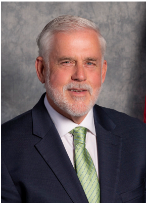
A Message From MAYOR JERRY P. WEIERS