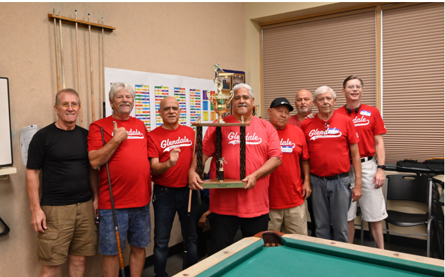
Congratulations to our Glendale Adult Center billiards team for winning the 2025 Grand Canyon State Billiards Tournament!

Billiards • Room 114 Open recreational play during operating hours.