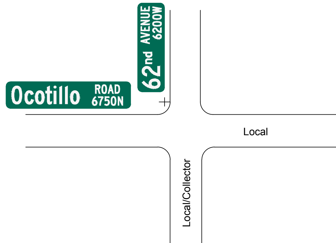
Local/Collector to Local 4-Way Intersection