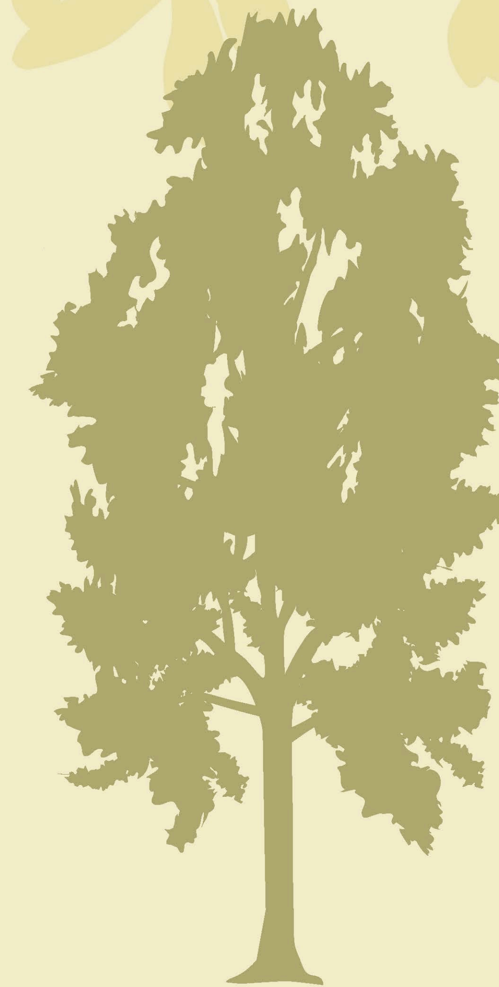
Narrow, upright tree