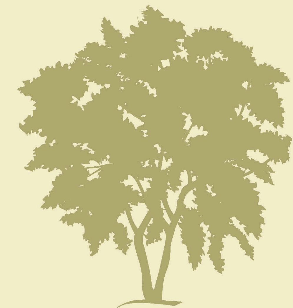
Short, shrubby tree