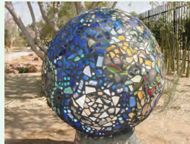
The Blue Planet - Garden Artwork

Desert Plant and Animal Adaptations Sonoran Desert Ecology Water Conservation Water Resources