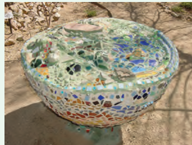
The Watershed - Garden Artwork