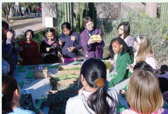
Students learn about desert ecology through hands-on activities

Location: The Glendale Xeriscape Demonstration Garden is located on the grounds of the Glendale Main Library (5959 W. Brown Street, Glendale, AZ 85302). Youth participants are to be dropped off and picked up at the driveway that is directly north of the library.