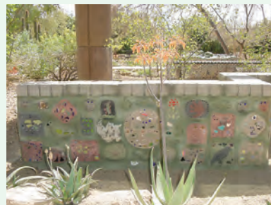
Desert Life - Garden Artwork